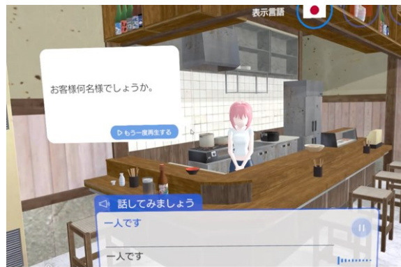
Fig. 2: Pub ( izakaya ) scene