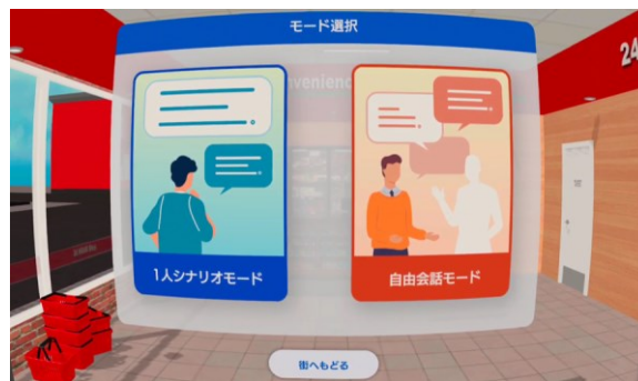
Fig. 3: Mode selection screen